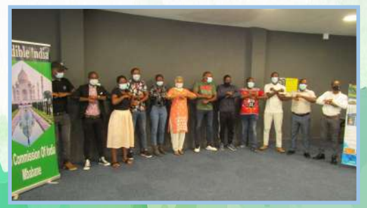
Latest batch of selected ICCR students at HCI offices before leaving for India